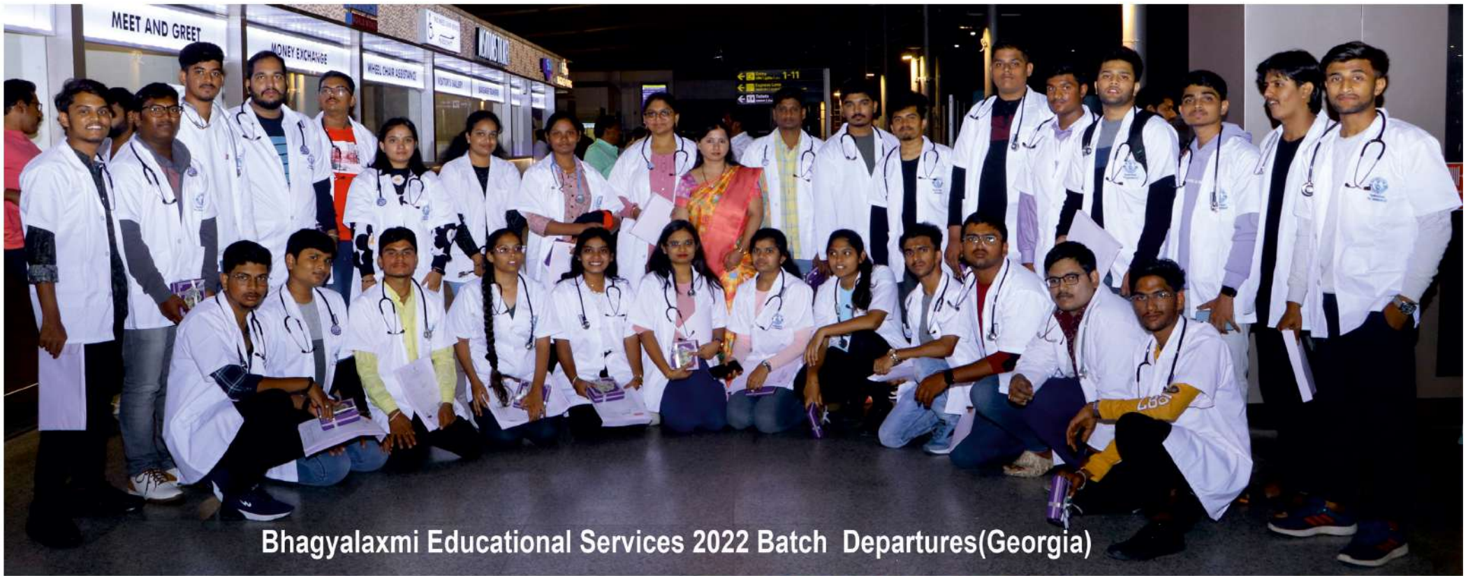
Bhagalaxmi Educational Services 2022 Batch Departures(Georgia)